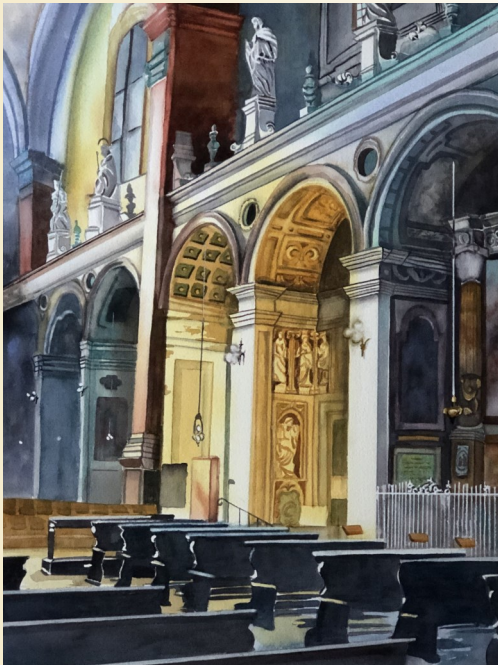
"San Giacomo Maggiore, Italy " by Sue Roach